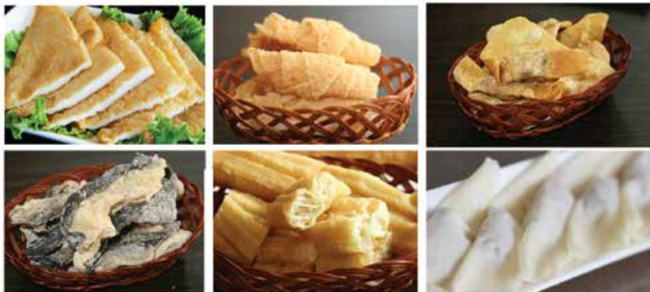
All photos are for reference only. Prices subject to prevailing GST and service charge.